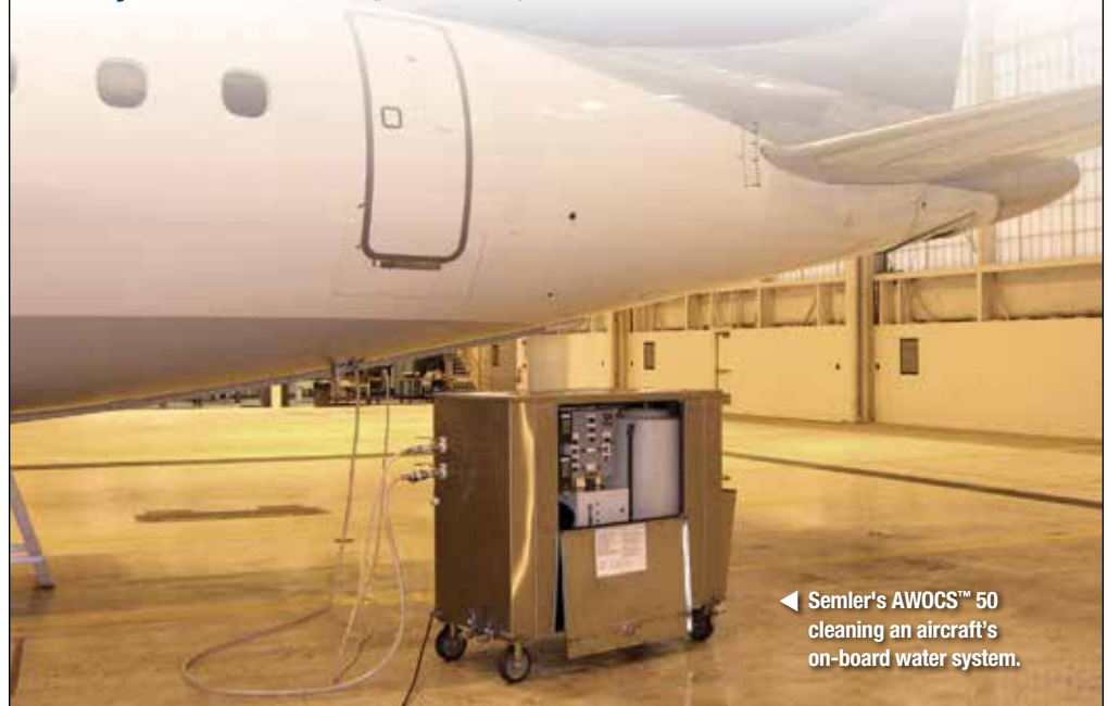
◀ Semler's AWOCS™ 50 cleaning an aircraft's on-board water system.