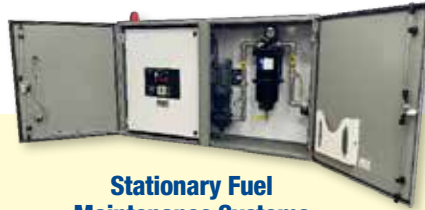
Stationary Fuel Maintenance Systems