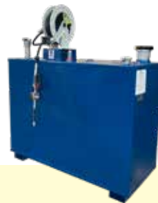
Lube Oil Storage & Dispensing