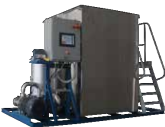
Diesel Exhaust Fluid