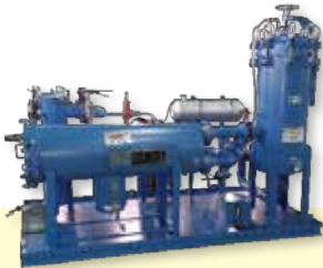
High-Flow Fuel Polishing Skids