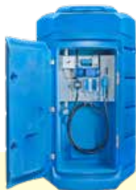
DEF Storage & Dispensing