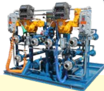
Aviation Fuel Loadout & Transfer Systems