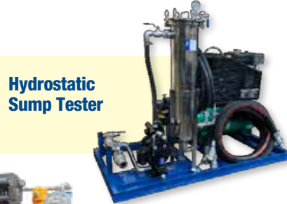
Hydrostatic Sump Tester