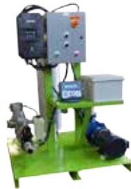
DEF Transfer & Packaging Systems