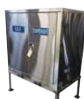
High-Flow Rail Dispensing Cabinet