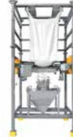
Bulk Bag Unloader / Support Assemblies