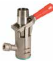
Closed Loop Transfer Couplers