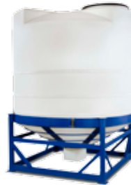
DEF Blend Tank