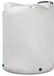
High-Purity Water & DEF Storage Tanks