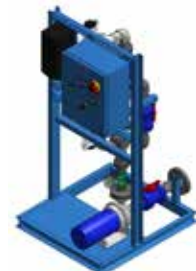
UV Recirculation Systems to Maintain Water Quality