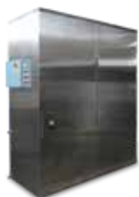
Modular Mini-Bulk Systems