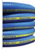
Bulk DEF Hose & Assemblies