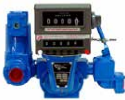
Weights & Measures Approved Meters for DEF Custody Transfer