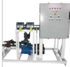
Water Batching Meters & Systems