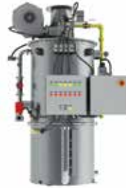
Water Heating Systems