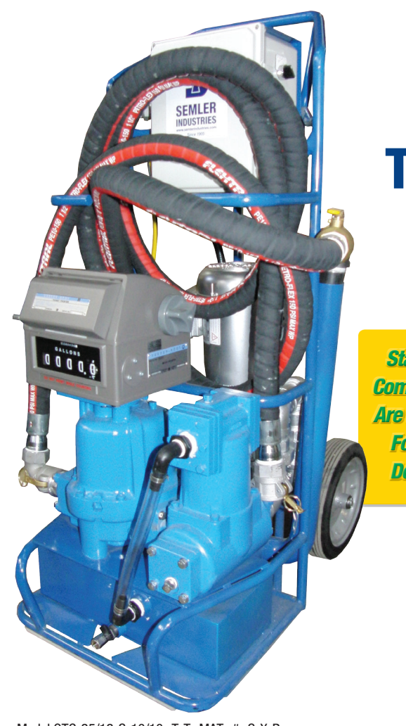
Model OTC-25/12-S-10/10- T-T- MAT- # -S-X-R front view shown.