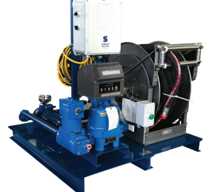
Antifreeze and Engine Fluid Transfer Systems