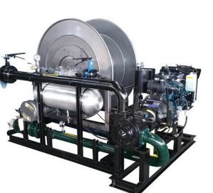
High Flow Diesel Transfer Systems