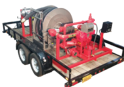
Mobile Fuel Transfer