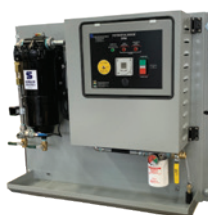
Stationary Fuel Polishing