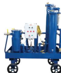
Mobile Fuel Polishing