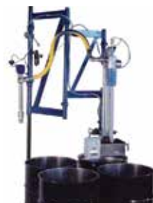
Drum Filling & Leak Detectors