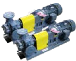
Pump Assemblies Per your specifications & needs