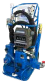
Transfer Carts for Petroleum Products, Chemicals & Fuels