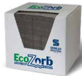
Absorbent Media and Spill Kits