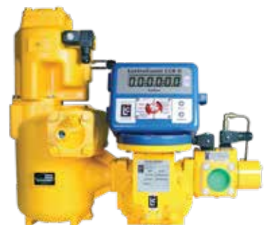
Meters & other Instrumentation