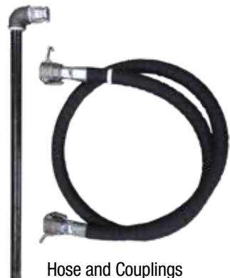
Hose and Couplings