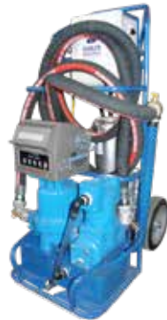
Functional Engine Fluids Transfer Carts