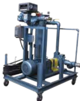
Mobile Custody Transfer & Filtration Systems