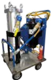
Fuel Polisher Cart