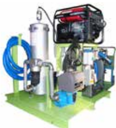
Diesel Exhaust Fluid Transfer Systems DEF-Distributor™