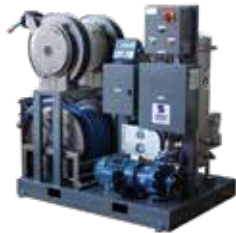
Dual-Flow-Rate Fluid Transfer & Metering Systems